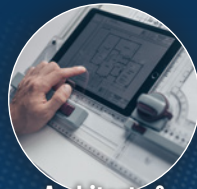
Architects & Architecture