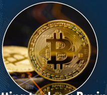
Getting to close: Buying with Crypto

Come to the MIAMI Global Real Estate Congress