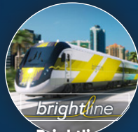
Brightline High-Speed Train