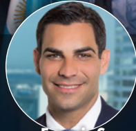
MAYOR Francis Suarez City of Miami