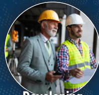
Developing South Florida