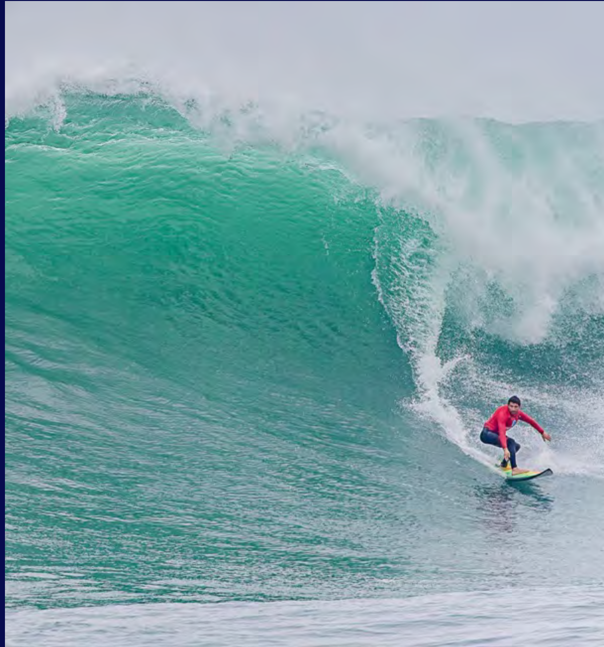
Peru is a Bucket list destination for Surfers