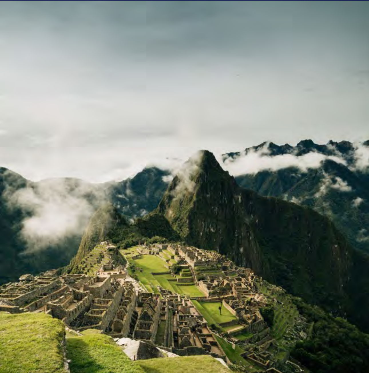
Machu Picchupichu is one of the new seven wonders