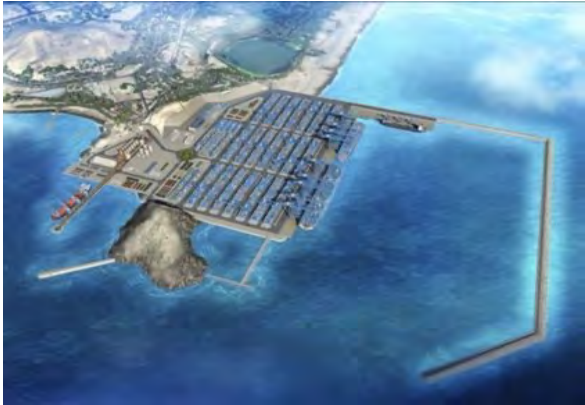
MEGA PUERTO DE CHANCAY