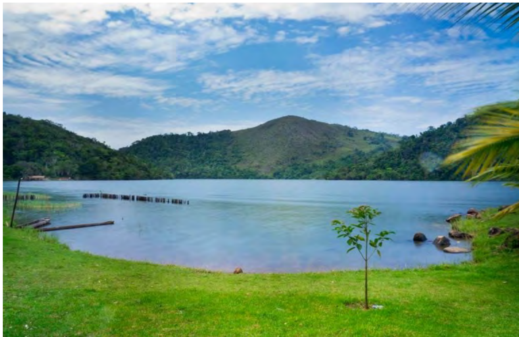
JUNGLE FOR HOTELS - LUGUNA AZUL – TARAPOTO