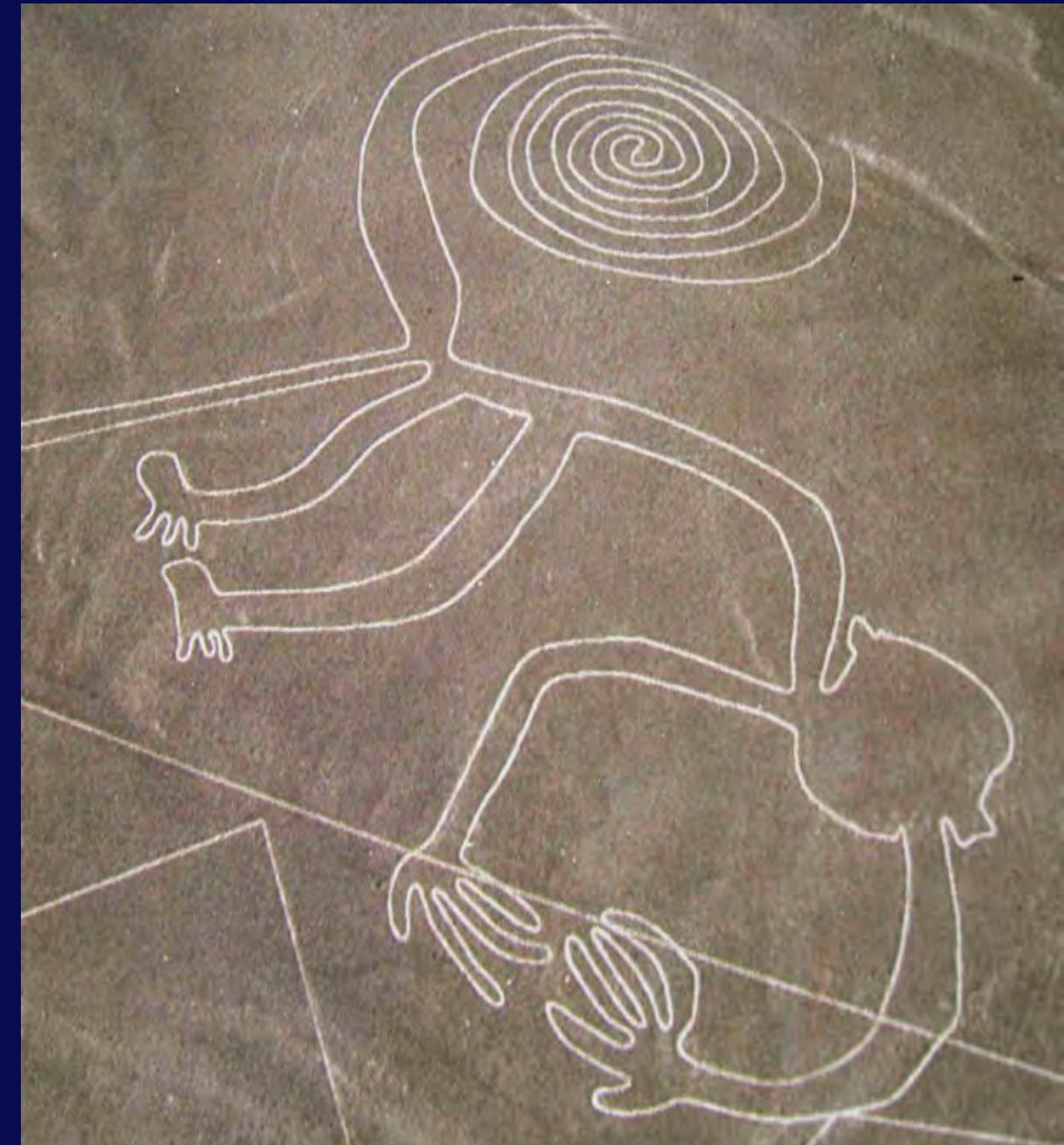
The Nazca Lines are a collection of giant geoglyphs