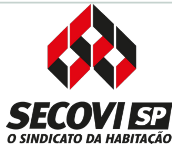
SINDICATO DAS EMPRESAS