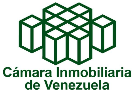
CÁMARA INMOBILIARIA DE VENEZUELA