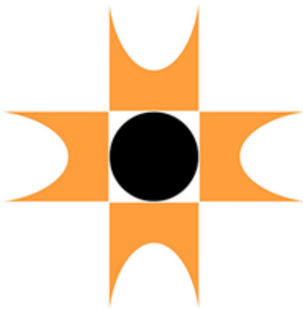
MALAYSIAN INSTITUTE OF ARCHITECTS