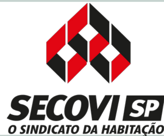
SINDICATO DAS EMPRESAS