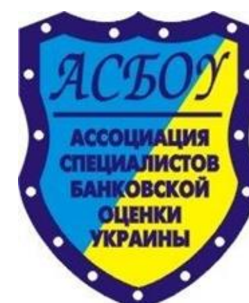
UKRAINIAN ASSOCIATION OF BANKING VALUATION SPECIALISTS