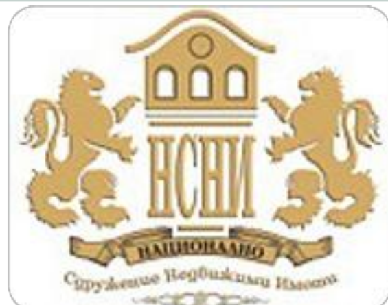
NATIONAL REAL ESTATE ASSOCIATION OF BULGARIA