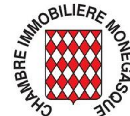
CHAMBRE IMMOBILIÈRE MONÉGASQUE