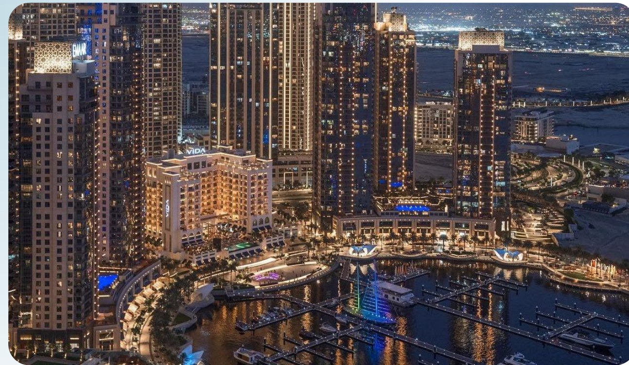
Dubai Creek Harbour