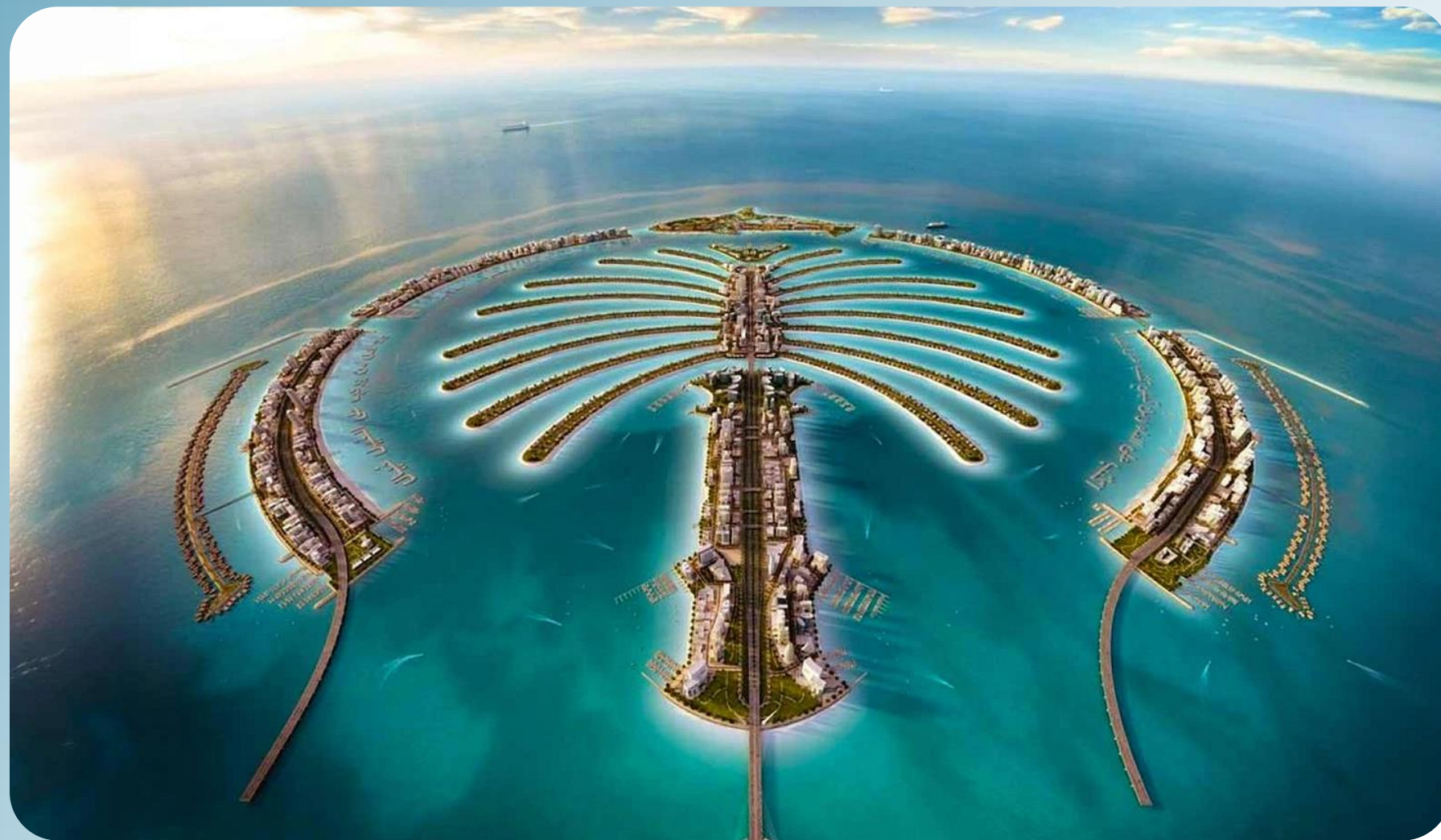
Palm Jebel Ali