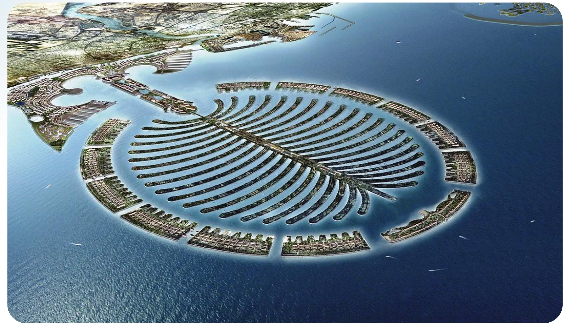
Palm Deira (Dubai Islands)